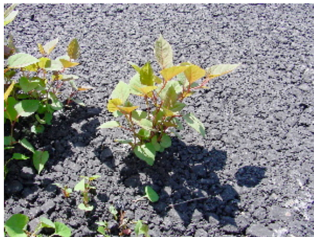
Figure 3. Knotweed shoots emerging through asphalt. Knotweed not only limits sight distance, it physically damages shoulders and road edges.

Encouraging or establishing alternative groundcover provides competition to knotweed, and will enhance the effects of other treatments. However, Japanese knotweed appears to inhibit the growth of other plants. In trials where Japanese knotweed growing in a monoculture has been controlled, only a few weed species seem to colonize