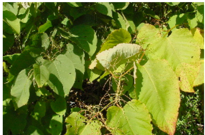
Figure 2. Japanese knotweed (left) and giant knotweed (right) occur throughout Pennsylvania. The leaves of Japanese knotweed are usually 4 to 6 inches long, while the leaves of giant knotweed can reach 12 inches in length and are distinctly heart-shaped. Though often confused with each other, there is little chance of confusing these imposing plants with any other species. The knotweeds have similar adaptations and growth habits, and can be regarded as equally problematic.

By Art Gover, Jon Johnson, and Larry Kuhns, 2005. This work was sponsored by the Pennsylvania Department of Transportation. The contents of this work reflect the views of the authors who are responsible for the facts and the accuracy of the data presented herein. The contents do not necessarily reflect the official views or policies of either the Commonwealth of Pennsylvania or The Pennsylvania State University, at the time of publication. This work does not constitute a standard, specification, or regulation.