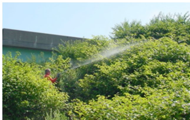
Figure 4. A high-volume foliar application is the best method to treat knotweed that has not been cut. This application should be made after July 1 and before a killing frost.

the former knotweed area the next growing season. Giant knotweed appears to cause less inhibition, and we have been able to revegetate these areas with cool-season grasses. Revegetating treated knotweed areas with grasses allows you to use herbicides that will injure the knotweed regrowth but not harm the grasses.