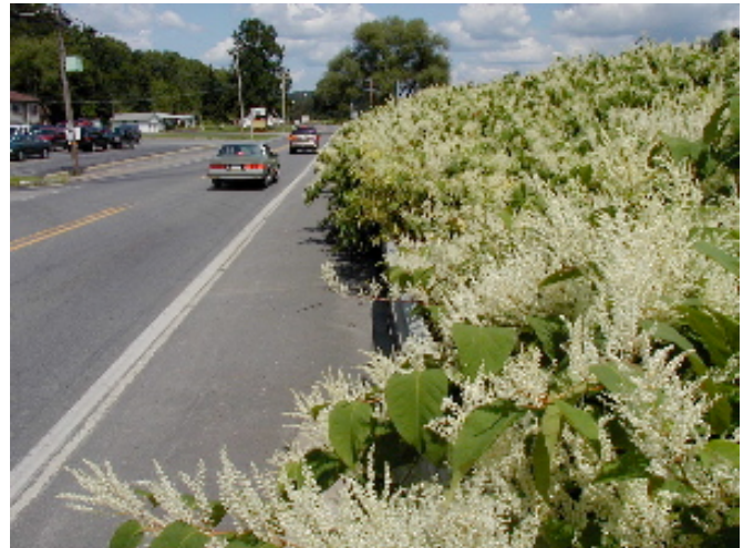
Figure 1. Showy flowers of Japanese knotweed. The knotweeds were introduced to the U.S. in the late 1800's as ornamentals due their prominent late-season flower display and striking height. Due to its great size, knotweed reduces sight distance and encroaches on the travel lanes, particularly on secondary roads.

The key to controlling knotweed is controlling the rhizome system of the plant. Knotweed is one of those plants best thought of as being like an iceberg - what